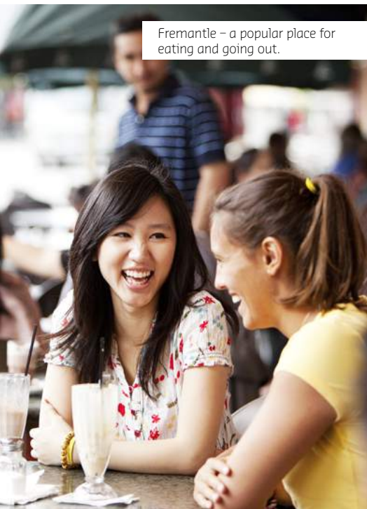
Fremantle – a popular place for eating and going out.

With an excellent standard of living, Perth is more affordable than Sydney, Melbourne, Brisbane and Adelaide. It offers the qualities and amenities of an international city in an idyllic, laid-back setting.