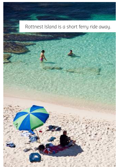
Rottneet Island is a short ferry ride away.