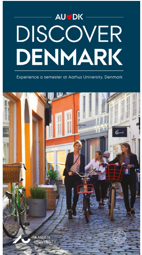
Cover page for a couple of our brochures