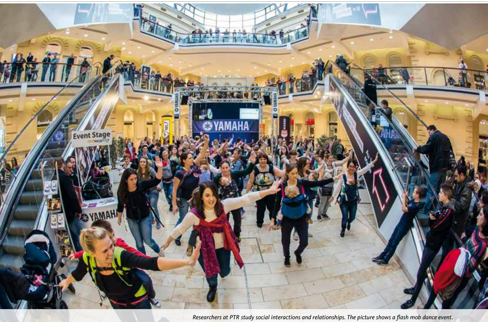
Researchers at PTR study social interactions and relationships. The picture shows a flash mob dance event.

The Research Institute for Philosophy, Theology, and Religious Studies (PTR) enhances knowledge related to fundamental questions about society, human beings and their place in the natural world. Its research is organized in three interdisciplinary thematic programmes.