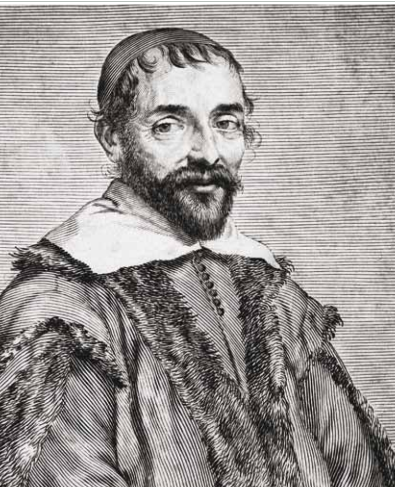
Pierre Gassendi (1592-1655; French philosopher, scientist and mathematician) introduced a theory of the universe: a homogeneous entity with independent bodies.