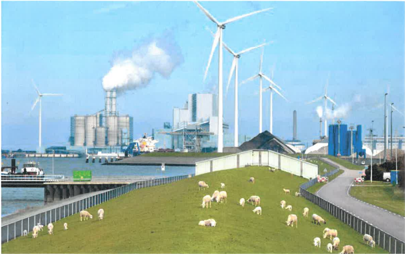
IMR researchers perform high-quality, multidisciplinary research on the environment and the economy.

The Institute for Management Research (IMR) is the research institute of the Nijmegen School of Management (NSM). Its members carry out high-quality, multidisciplinary research on the environment, the economy and governance of our society. Researchers in business administration, economics, political science, public administration, geography, planning, and environment studies combine their expertise, theories and methodological approaches to study complex societal issues and develop pertinent solutions. IMR also prepares PhD students for an academic, business or government career, provides post-academic education, and plays a leading role in societal debates in order to carry out its main task: creating knowledge for society.