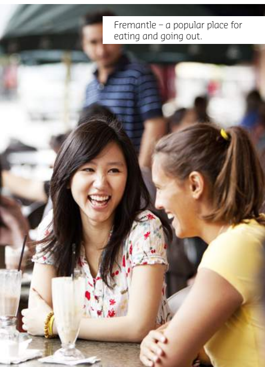
Fremantle – a popular place for eating and going out.

With an excellent standard of living, Perth is more affordable than Sydney, Melbourne, Brisbane and Adelaide. It offers the qualities and amenities of an international city in an idyllic, laid-back setting.