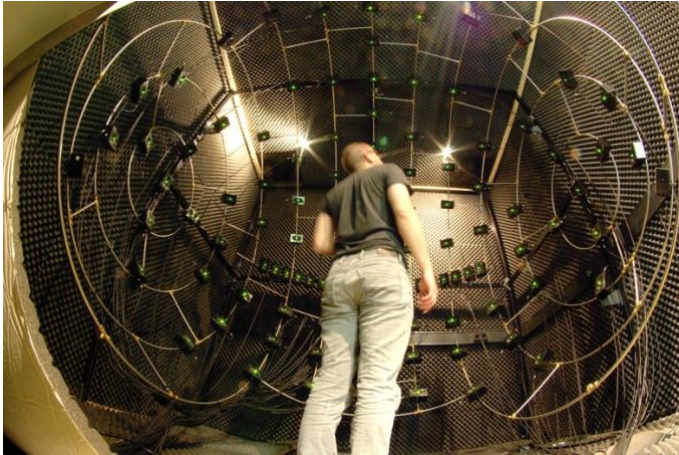
Figure 2. The Sphere. One of the sensorimotor labs.