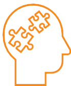
Student Counselling Service