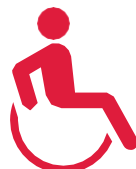
Disability Support Service