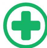
Student Health Services